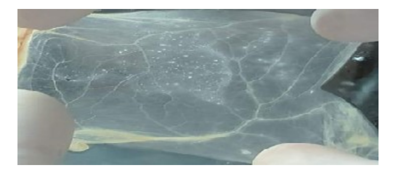
Fig. (1) Pock Lesions CPE of Lumpy Skin Disease Virus Isolated SPF ECE CAM.

LSDV was isolated from skin nodule (n=21) collected from infected cows (3 Menofya, 11 ElQalyubia, 3 Kafr El-shikh, 2 El-Behera,1 Asuit and 1 Domiat). based on the appearance of characteristic pock lesions on the CAM of ECE (Fig.1).