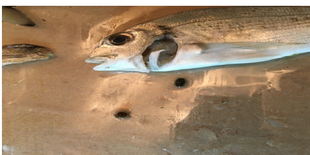
Figure (3) Opened mouth and degeneration of gill filament due to juvenile isopoda embedded in gill chamber.